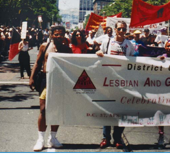
LAGIC on the march at Gay Pride. This year marks

The ribbon cutting marked a quarter century from a time when being openly Lesbian or gay meant harassment and discrimination at the workplace, and a lack of rights that other workers took for granted, such as bereavement leave if a partner passed away. Partners also did not receive health coverage and other union benefits.