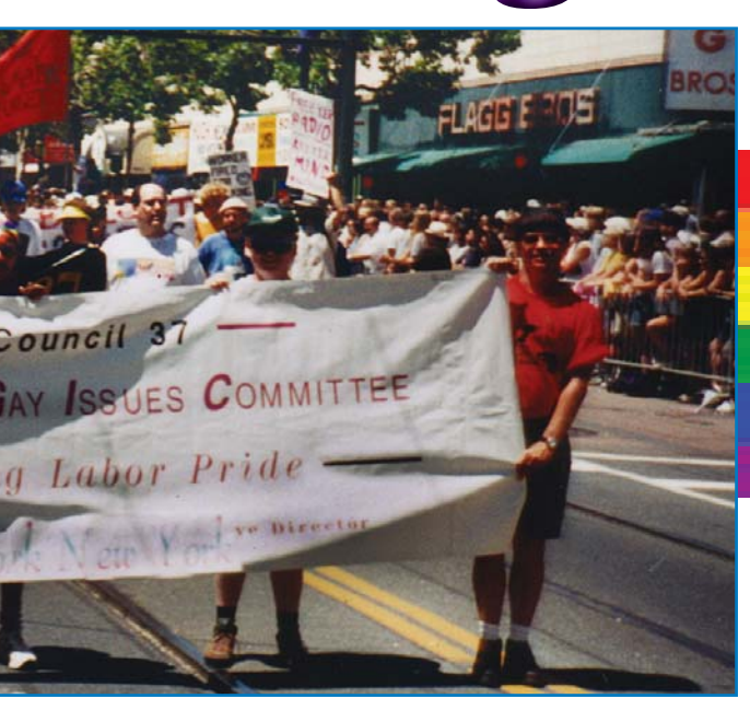
s the 25th anniversary of the formation of the group.